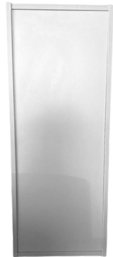
Base Cabinet Back