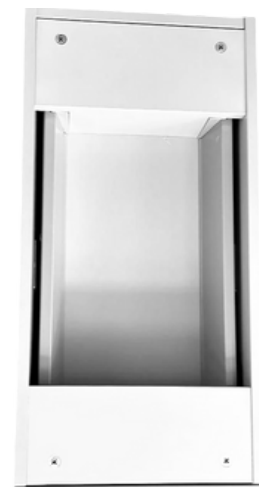
Base Cabinet Top